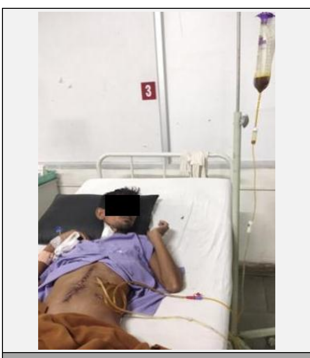
Figure 3. Actual Picture Showing Tube Placement and Collection System to Collect and Replace Digestive Juices

The patient was discharged on POD 8 with the tube in situ and was in regular follow-up. After 7 weeks the tubes were removed first FJ tube followed by RD tube. The post-operative period being uneventful.